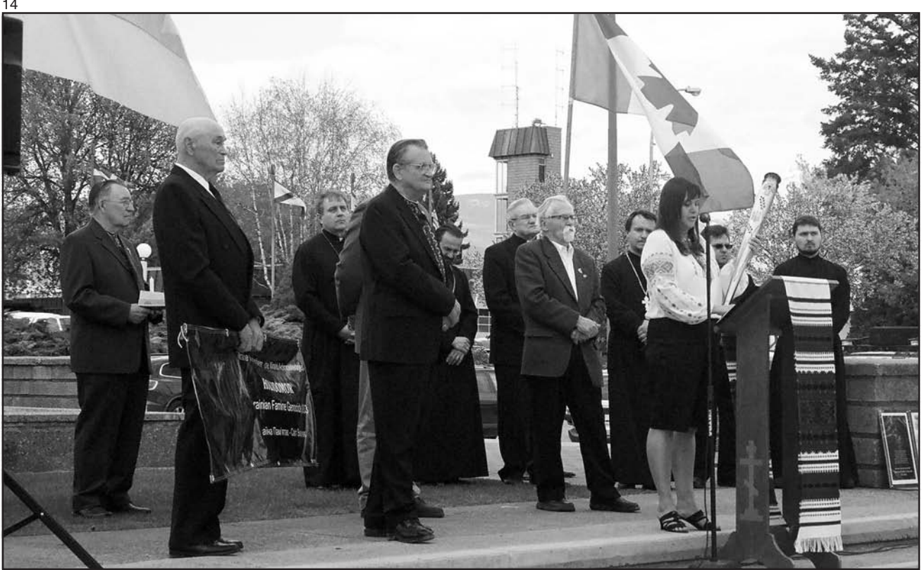
Youth representative speaks during the Vernon ceremony.